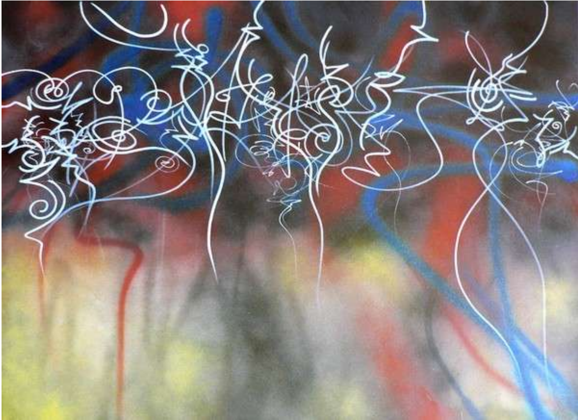
Post graffiti 2009