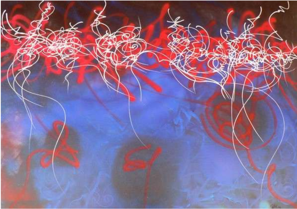
Post graffiti 2009