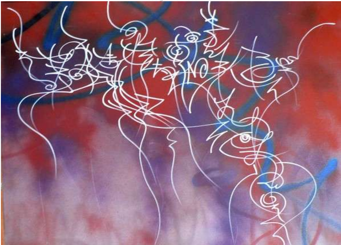
Post graffiti 2009