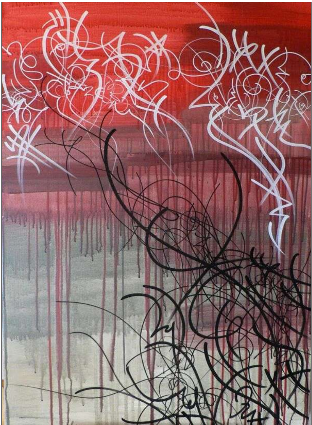
Nuno de Matos