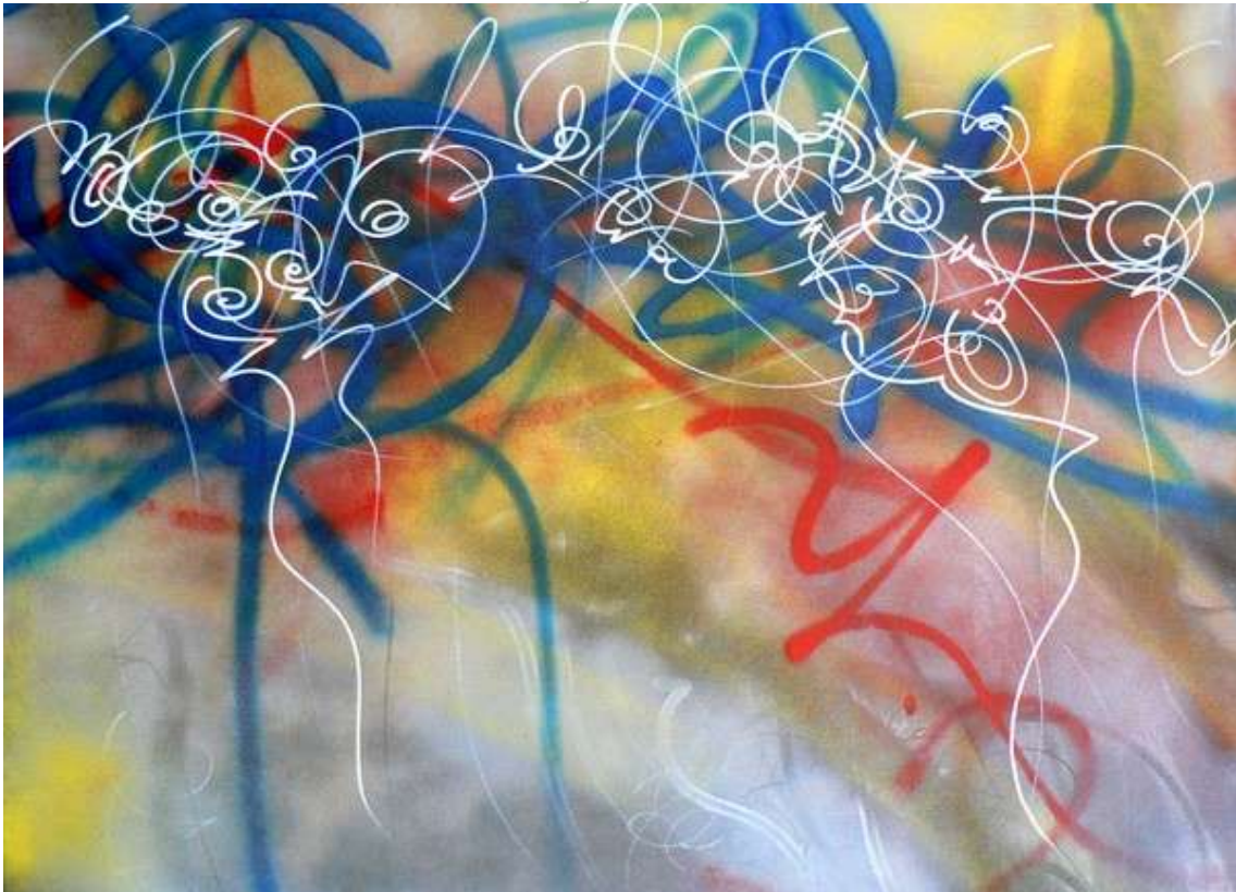
Post graffiti 2009