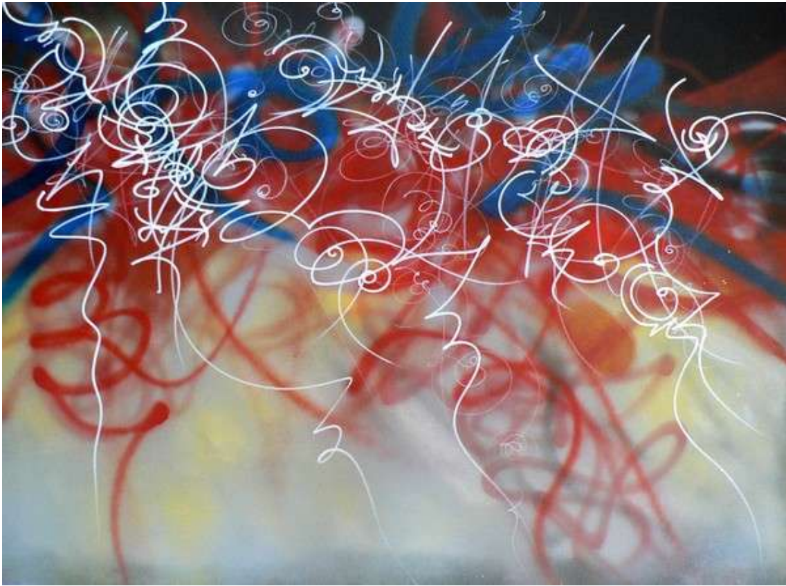
Post graffiti 2009