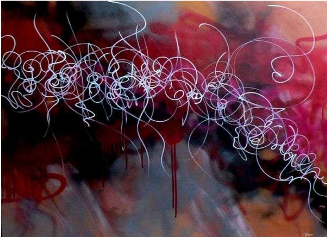
Post graffiti 2009